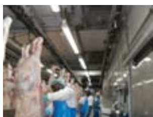
Slaughter and deboning lines, integrated total solutions for up to date abattoir projects