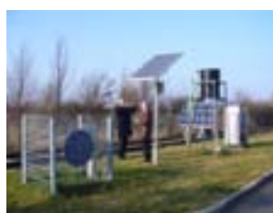
Solar powered solutions for drinking water supply