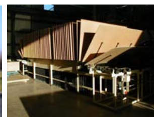
Agri-fibre panel board plants

Based on our knowledge of meat products and our large and important network in the Dutch and EU slaughtering and meat processing industry we are also active in the international trade in meat products. We supply quality meat products to selected customers in Africa (all cuts from the carcass, bone-in cuts, deboned meat products, by-products such as feet, knees, trimmings, organs, MDM, poultry products etc.).