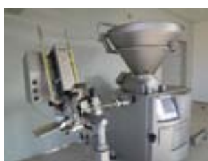
Meat processing and packaging solutions